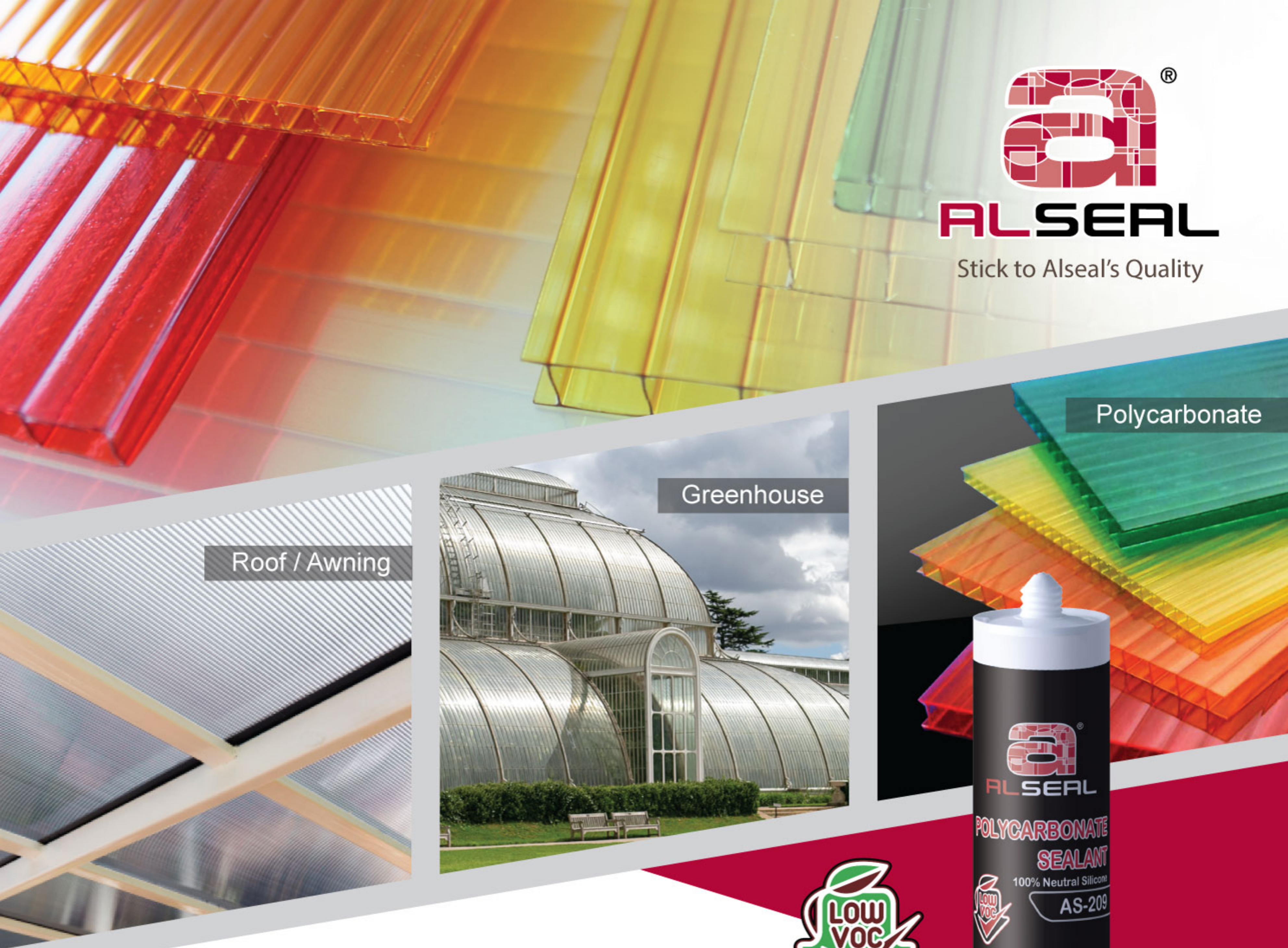
Roof / Awning